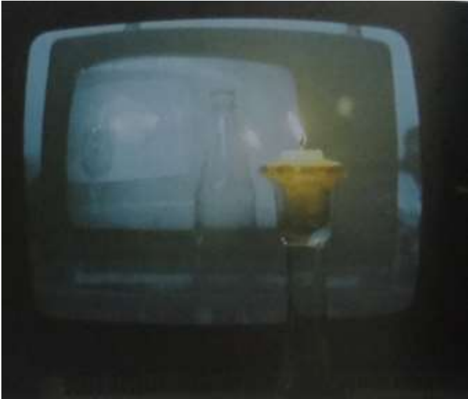
Reinstalation in NOD Prague, 2010: